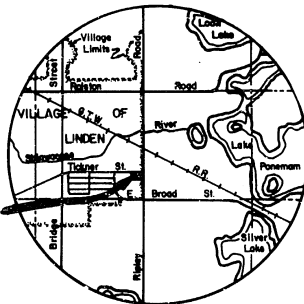
LOCATION SKETCH NO SCALE